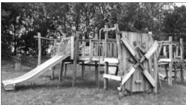
Trevor Stewart's stunning Windmill-themed multi-play structure, centrepiece of the play park